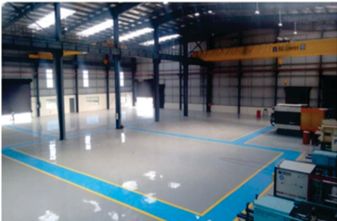
M/S Shree Motherplast Pvt Ltd (Vallam-Chennai) Main Factory Inside View