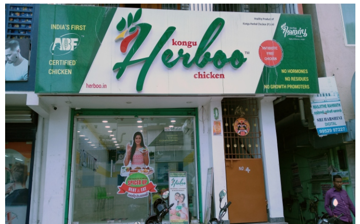
Shop at Velachery- Chennai Front View