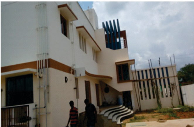
Bungalow at Thenneri – Side View