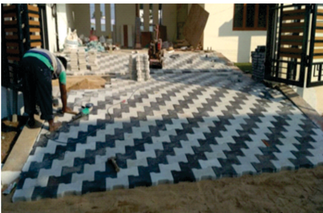
Bungalow at Thenneri – Car Parking Area Paver Laying