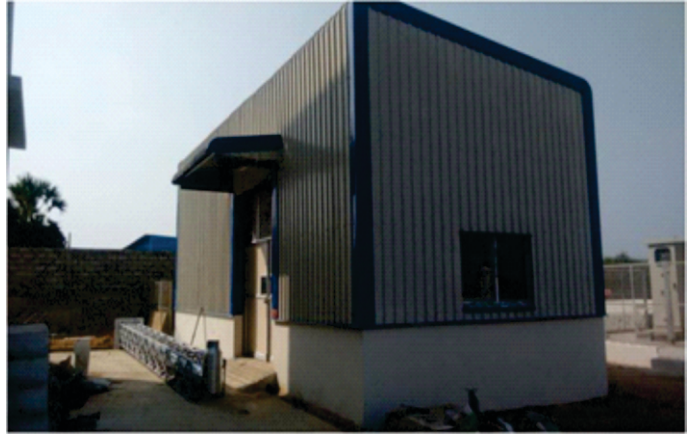
M/S Shree Motherplast Pvt Ltd (Vallam-Chennai) Electrical Panel Room