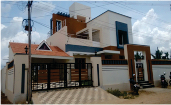
Bungalow at Thenneri - Frontside View-1

Church (Sunguvarchatram-Chennai) : In 2017 (Elevation Work) – Rs 0.10 Crore