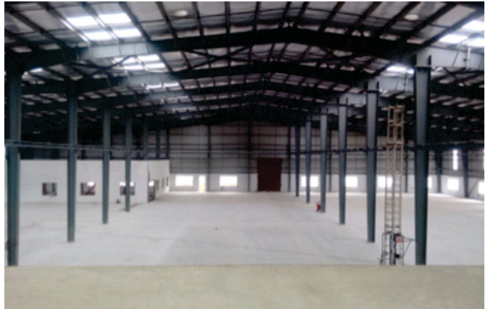
M/S Asian Sealing Products Pvt Ltd (Pillaiakkam- Chennai) Main Factory Inside View