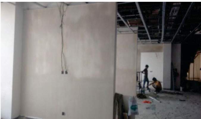
M/S RUHRPUMPEN India Private Limited (Vallam-Chennai) Interior Area POP Punning Work