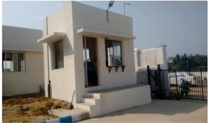
M/S Shree Motherplast Pvt Ltd (Vallam-Chennai) Security Building