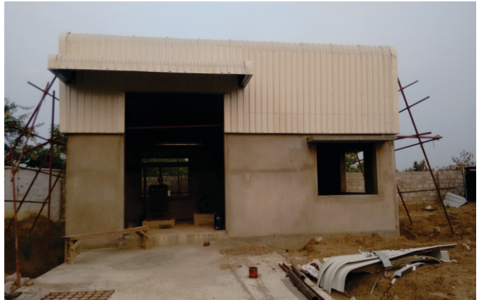
M/S Asian Sealing Products Pvt Ltd (Pillaiakkam-Chennai) UG Sump & Pump Room