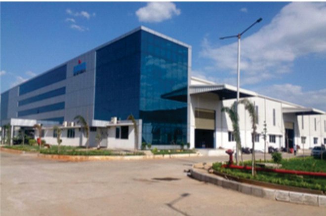
M/S Asian Sealing Products Pvt Ltd (Pillaiakkam-Chennai) Main Factory Frontside View