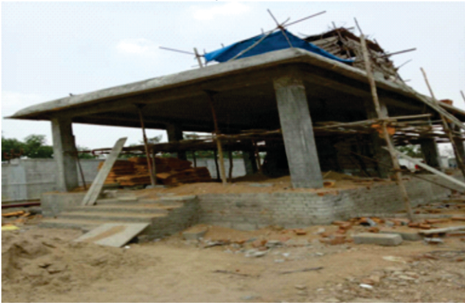
M/S Asian Sealing Products Pvt Ltd (Pillaiakkam-Chennai) Temple Construction Except Sthapathi Work