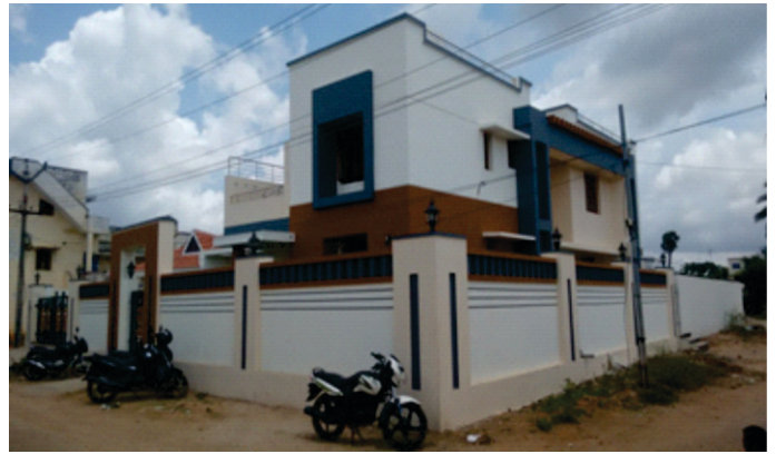
Bungalow at Thenneri - Frontside View-2