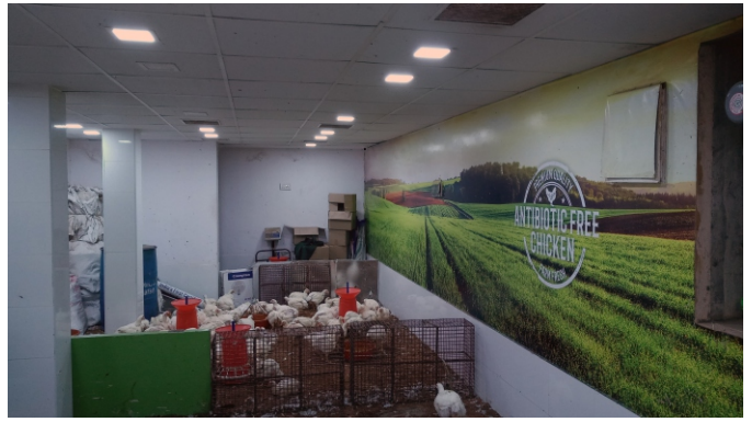
Shop at Velachery- Chennai Live Chicken Area Interior