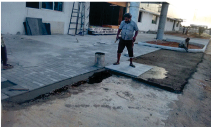
M/S Asian Sealing Products Pvt Ltd (Pillaiakkam-Chennai) Entrance Portico Tile Laying Work