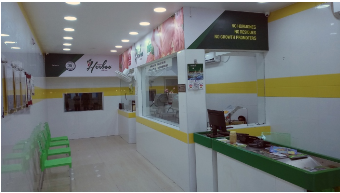
Shop at Velachery- Chennai Shop Interior