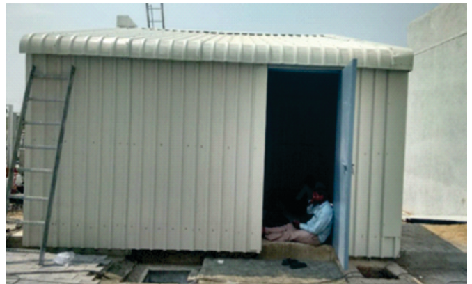
M/S RUHRPUMPEN India Private Limited (Vallam-Chennai) Electrical Panel Room Shed Work