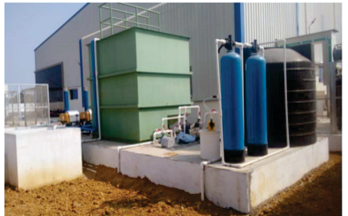
M/S Shree Motherplast Pvt Ltd (Vallam-Chennai) Sewage Treatment Plant