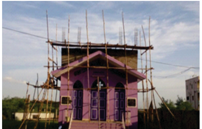
Church (Sunguvarchatram-Chennai) – Elevation Work