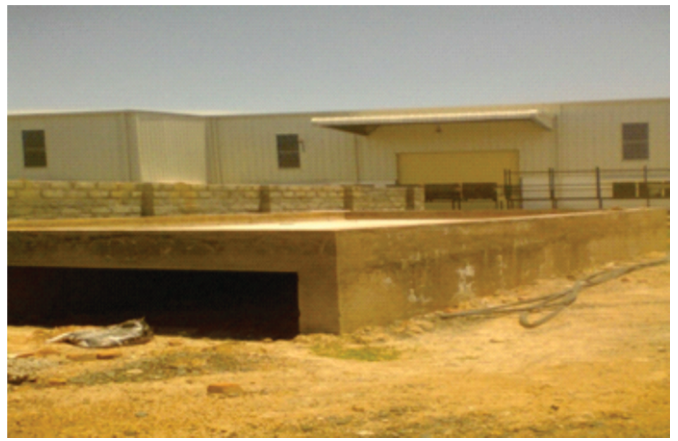
M/S Asian Sealing Products Pvt Ltd (Pillaiakkam-Chennai) Solar Evaporation Pond