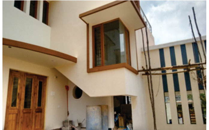
Bungalow at Thenneri – Corner Window Work