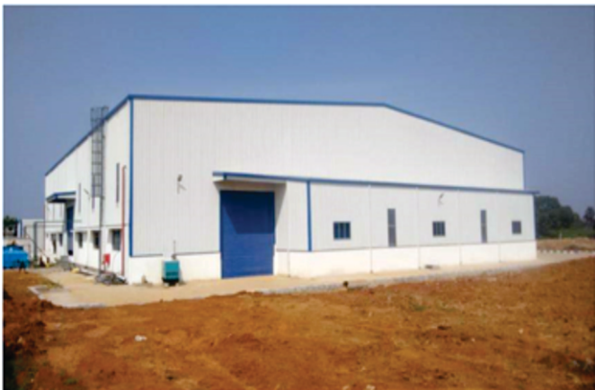
M/S Shree Motherplast Pvt Ltd (Vallam-Chennai) Main Factory Rear View