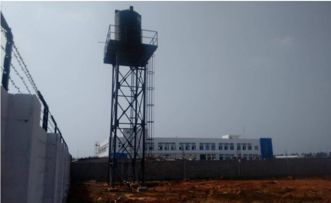
M/S Shree Motherplast Pvt Ltd (Vallam-Chennai) Over Head Water Tank Structural Work (10 KL Capacity)