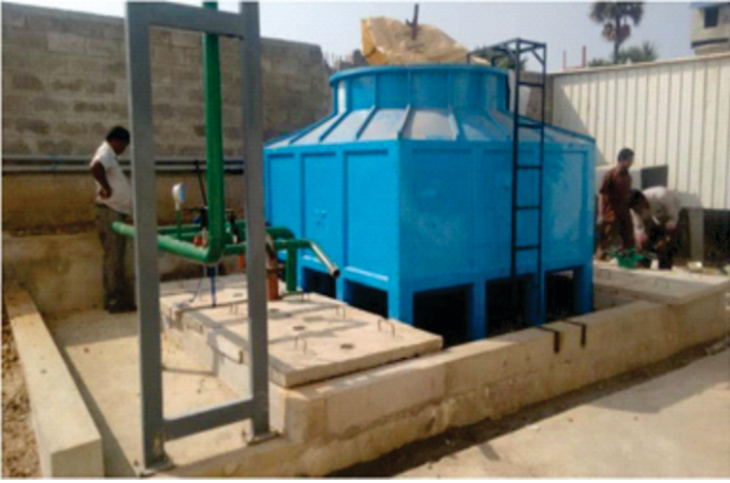
M/S Shree Motherplast Pvt Ltd (Vallam-Chennai) Cooling Tower