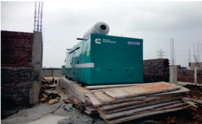
M/S Varroc Polymers Pvt Ltd (Oragadam-Chennai) DG Bed Foundation Work