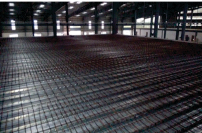
M/S Asian Sealing Products Pvt Ltd (Pillaiakkam-Chennai) Deck Slab Work