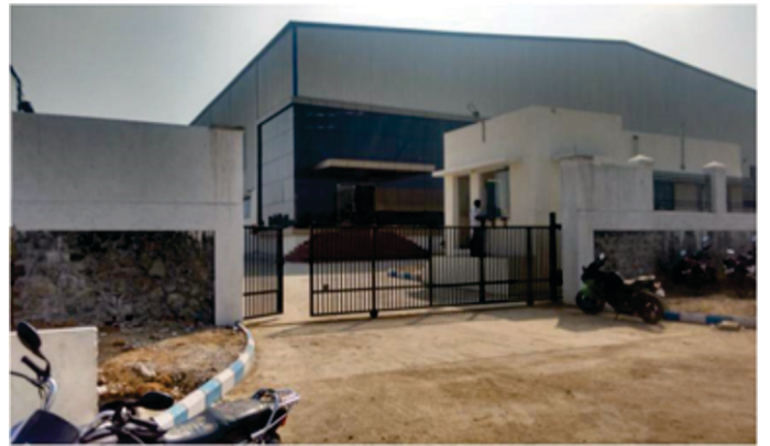
M/S Shree Motherplast Pvt Ltd (Vallam-Chennai) Main Factory Frontside View