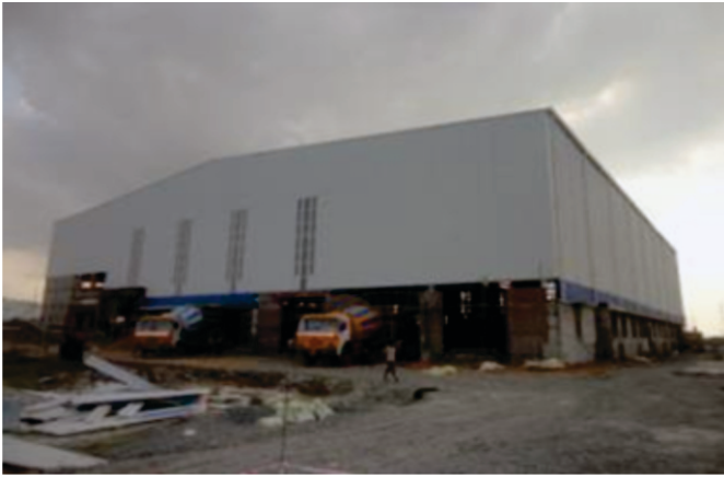
M/S Varroc Polymers Pvt Ltd (Oragadam-Chennai) Main Factory – Frontside View