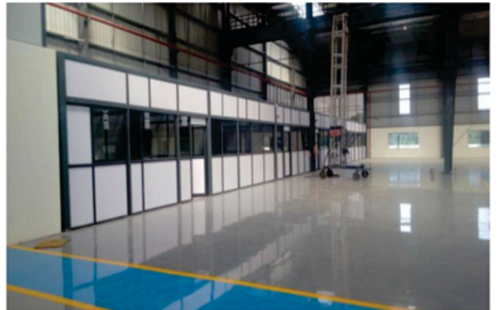
M/S Shree Motherplast Pvt Ltd (Vallam-Chennai) Office Area Partion Work